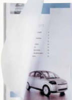
SteelMat for Resin SteelBinding