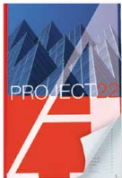
SteelBack for Resin SteelBinding