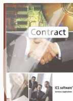
SteelCrystal for Resin SteelBinding